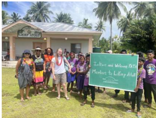
PATA folks visited Likiep Atoll on September 28

As part of their second meeting of the year, members of the Pacific Asia Travel Association, Micronesia Chapter, grouped down to visit communities on Arno and Likiep atolls in the Marshall Island. Doing this not only afforded a fist hand experience of local life away from the city-island of Majuro. This goes to show tourism expansion possibilities that require coordination from accommodations, transport businesses, couture programs, etc throughout Micronesia to spread derivative socio-economic gains to wider communities. Thanks to PATA for its dynamic role among Micronesia tourism and commerce partners throughout the years.