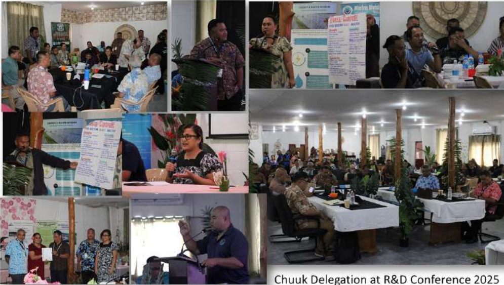
Chuuk Delegation at R&D Conference 2025

Lkkeir ekkewe ra tupwuni ar kewe ofes me emwicheich non fonuach Chuuk ne no fiti ewe oruanun FSM mwichenap faniten nenengeni peekin resources me development non fonuach kei non FSM.