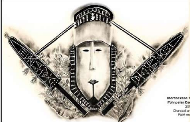
Mortlockese Tepwanu and Pohnpeian Dance Paddles 2019 Charcoal and Acrylic Paint on paper